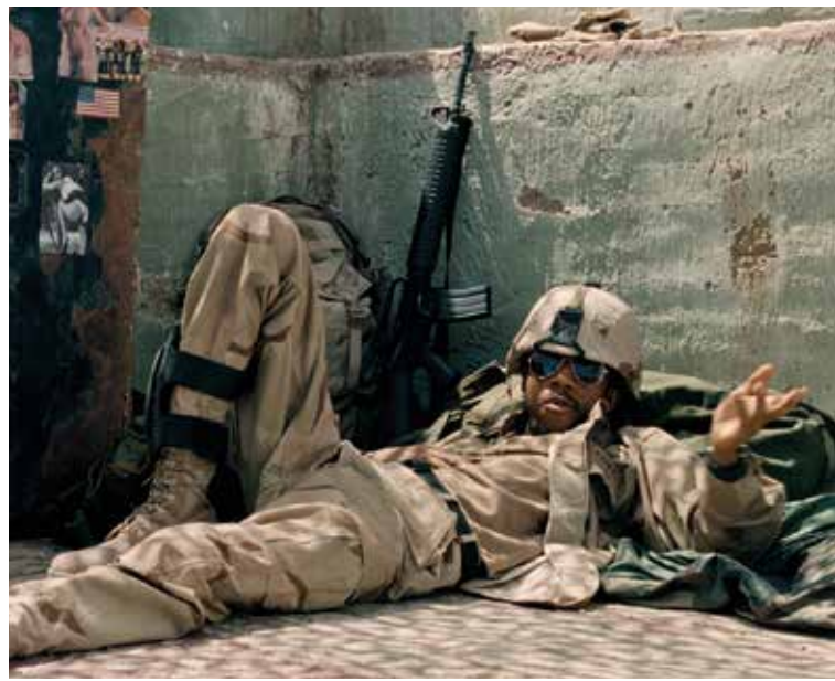
Waiting in the middle of nowhere.