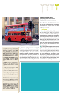
1/4 page 118 W x 86 H