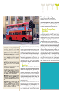
1/9 page 55 W x 80 H