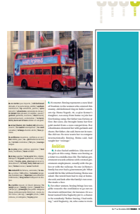
1/3 page height 55 W x 230 H