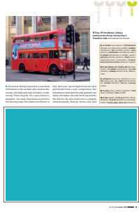
1/2 page width 176 W x 123 H