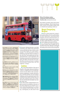
1/6 page 55 W x 123 H