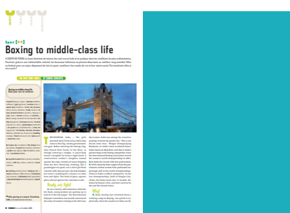
1/1 page 210 W x 287 H